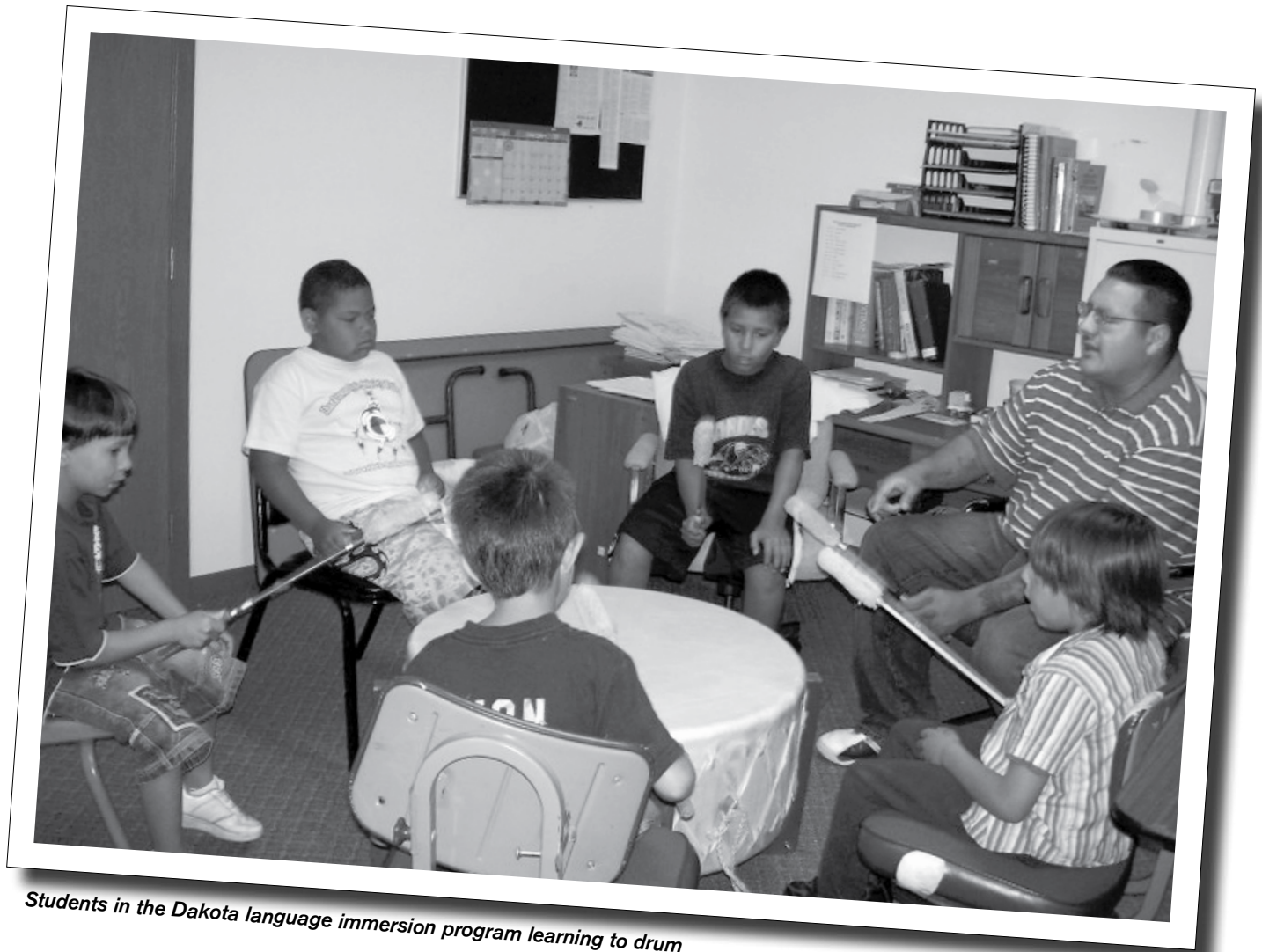
Students in the Dakota language immersion program learning to drum