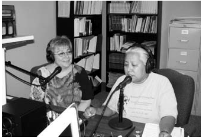
The most current project of the Resource Center is their new online streaming radio station. Tune in for hours of music and news straight from the Ihanktonwan Oyate. www.nativeshop.org .

services. The Indian Health Service (IHS) is the primary care provider for the majority of American Indians and Alaska Natives but has a history of inadequately providing care and abusing its power, especially when it comes to women's reproductive health. In the 1970s many Indigenous women were sterilized without their knowledge or consent and throughout the years Depo-Provera and Norplant have been administered without informed consent, proper documentation or follow-up. It was therefore not surprising to find that IHS is also lacking in its availability of Plan B, especially as an OTC drug. This only continues to illustrate the perpetual failure of IHS to properly and adequately provide services to American Indian and Alaska Native women, specifically in regard to developments in women's reproductive health.