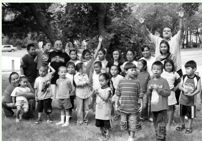
Students gathering from the Dakota language immersion program.

My time in Lake Andes was divided between working at the Native American Women's Health Education Resource Center and working and living at the Women's Lodge, a domestic violence shelter. At the Resource Center, which sits four blocks from the center of town, I spent forty hours a week along with three other interns working upstairs on various projects while downstairs the food pantry was open and the Dakota language immersion program was in session. The children in the program brought an incredible spirit to the Resource Center where they learned the Dakota language, drumming and various songs. The program exists in order to preserve culture as elders pass away and tradition and language are lost. Additionally, the