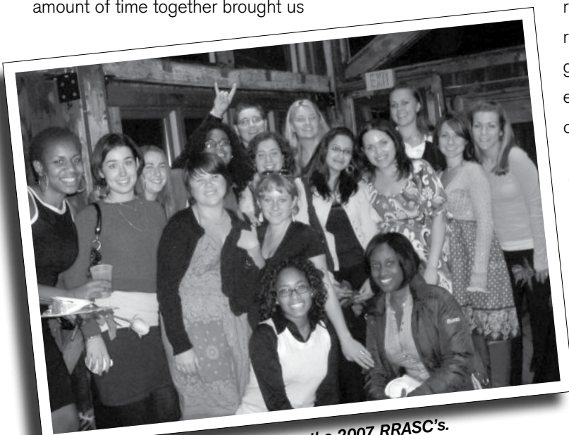
Celebratory intern dinner honoring the 2007 RRASC's.

The best part of my internship was the opportunity I had to meet lawyers in the international field. I truly enjoyed